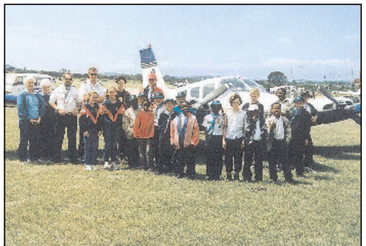
1st Port Alfred Sea Scout Group visit 43 Air School